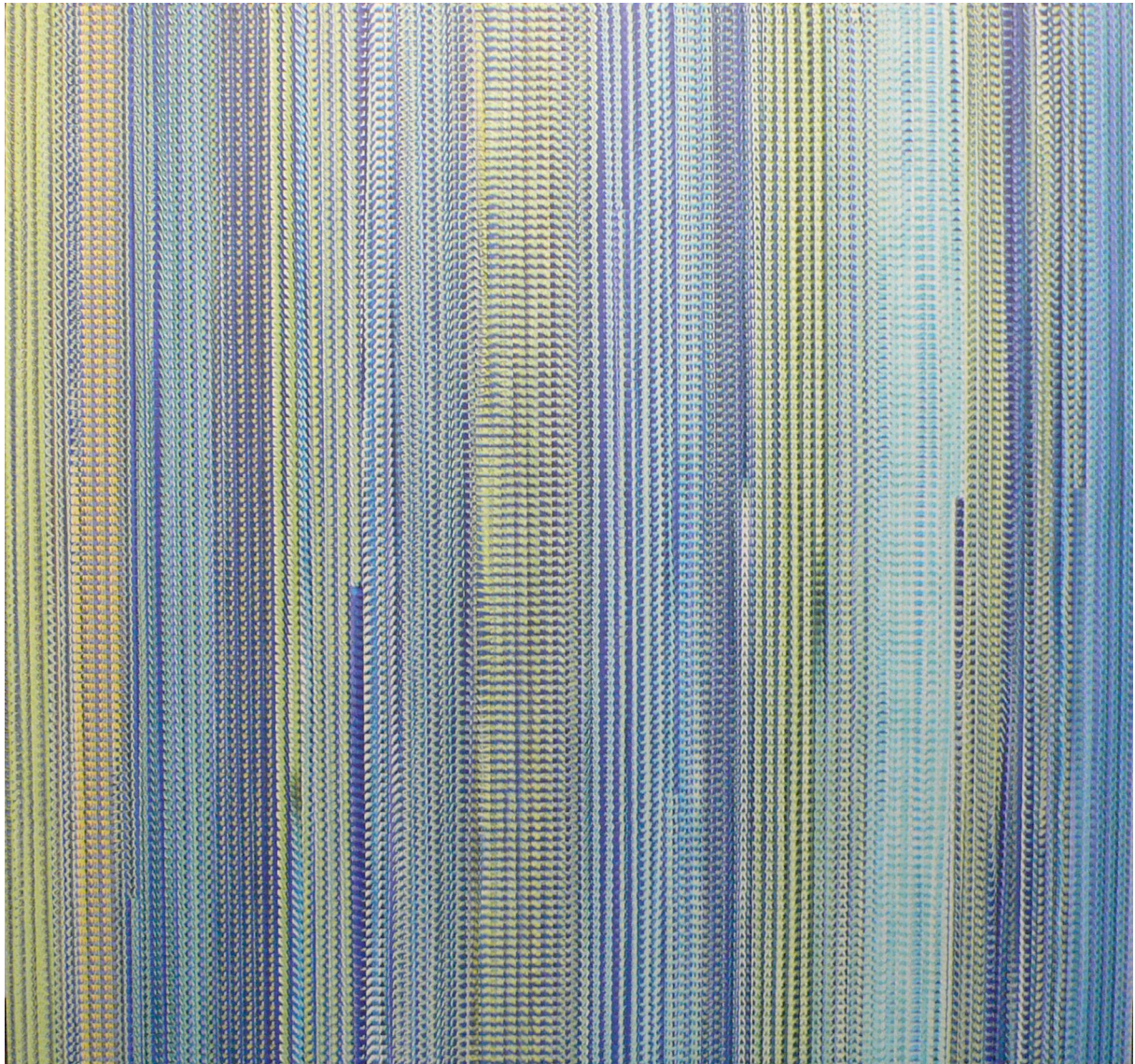
Sex im Wasser, 2009, Inkjet on canvas, 208 x 223 cm